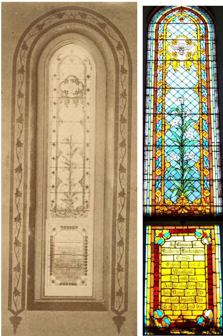
Photo on left shows the window decoration which surrounded each of the stained glass windows. (date unknown)