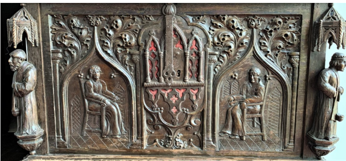
Below: detail of front

What's coming at Our Christmas contest! Not giving now, but we will 2nd and 3rd duplicate winning will be a drawing es! You know that editor is all about can be sure that the volve our St.