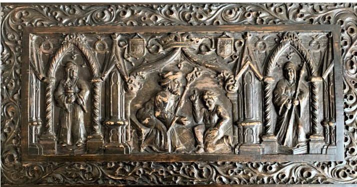
Above: detail of lid

This is almost as mysterious as our sanctuary floor!