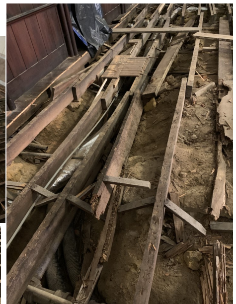
UNDER THE SANCTUARY FLOOR