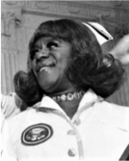
Flip Wilson, portraying "Geraldine," who's well-known "The Devil made me do it!" became a staple in pop culture.