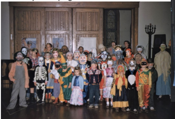
1958 Halloween Party