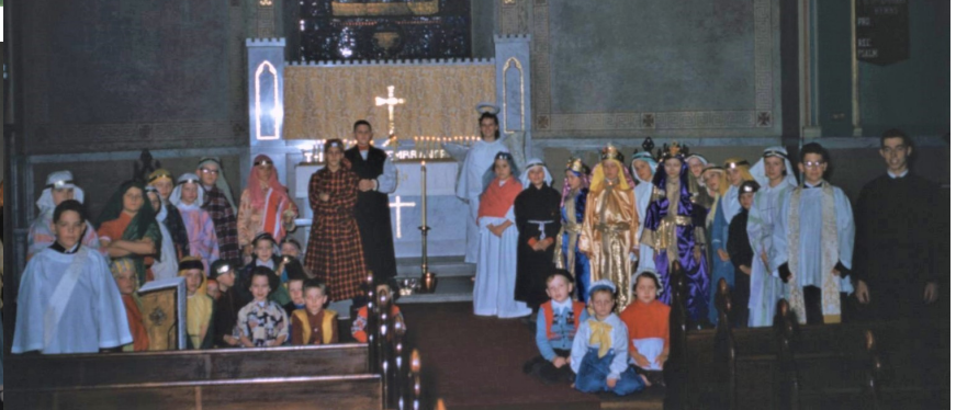
1959 Epiphany Pageant