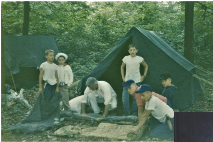
1958 Acolyte Camping