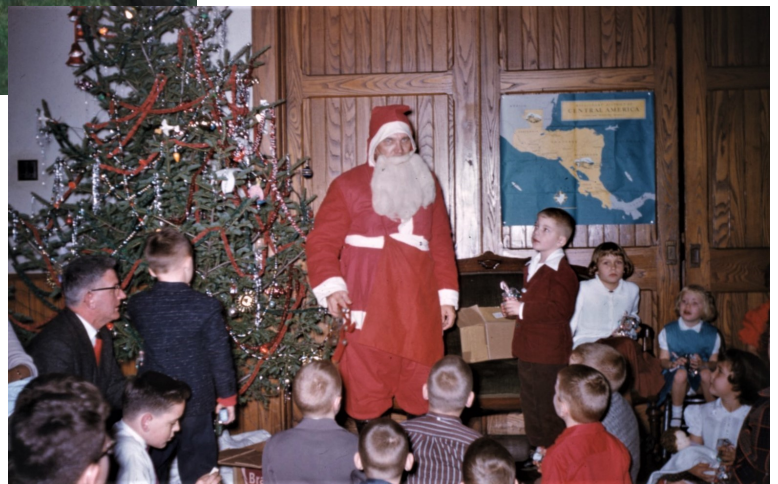
1959 Sunday School Christmas Party