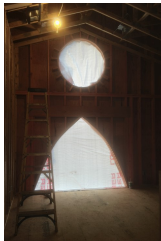
Second floor secretary's area; shows the top of the entry door and the round window above.